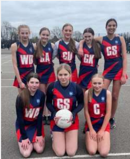
Year 9 Netball Team