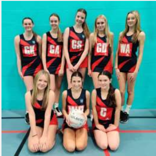
Year 10 Netball Team