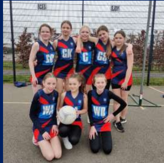
Year 7 Netball Team