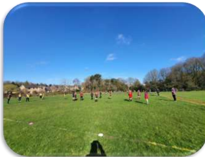
Y9 Sport Leaders delivering to KS3 Y7 PE as part of the training