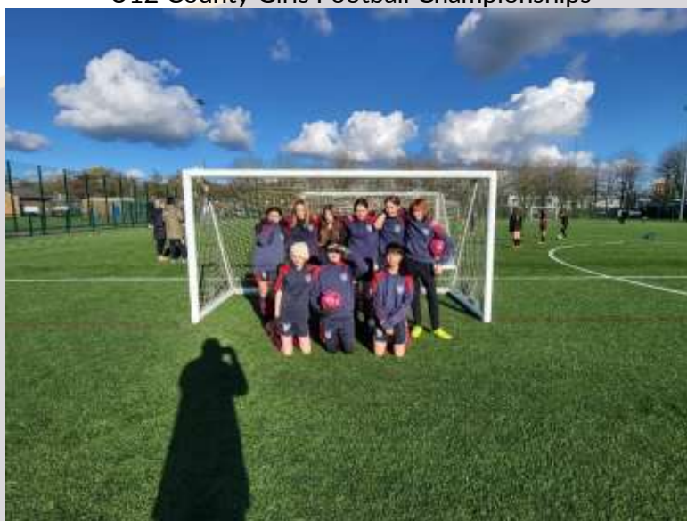
Y7 Warrington League