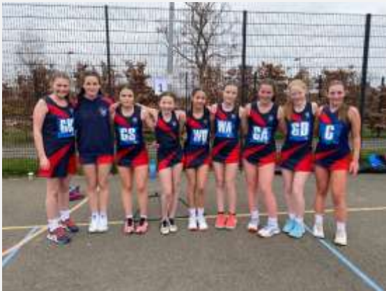
Year 8 Netball Team