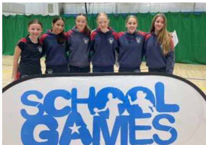
Y8 Girls' Team