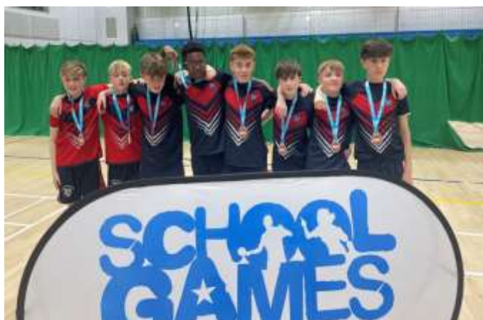
Y8 Boys' Team