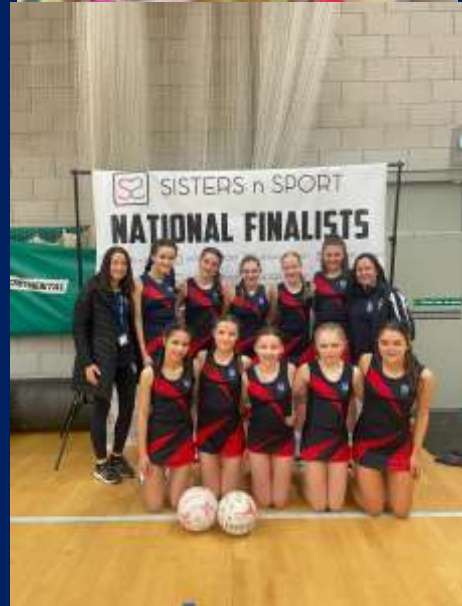
Year 8 Netball Plate Finalists