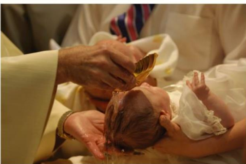
▲ Infant baptism