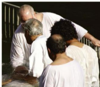
▲ Believers' baptism involves full immersion in a pool